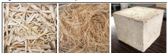
Figure 2. Selected Hemp Fiber Products

Source: Images show (left to right) hurds and bast fibers and concrete.