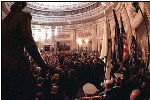
Figure 3. President Ronald Reagan's 1985 Public Inauguration Ceremony

Source: Library of Congress, Fish-eye view of the rotunda in the U.S. Capitol, just prior to the swearing-in ceremony of Ronald Reagan. Washington DC, 1985. Photograph. https://www.loc.gov/item/00652317 .