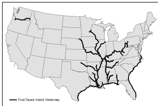
Figure 1. Inland and Intracoastal Waterways Subject to Federal Commercial Vessel Fuel Tax