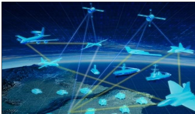
Figure 1. Visualization of JADC2 Vision