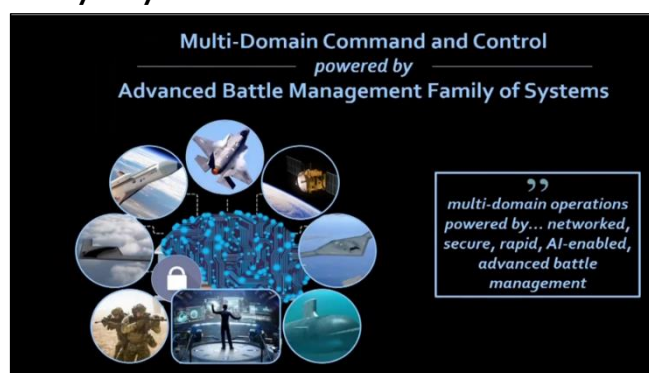
Figure 2. MDC2 and Advanced Battle Management Family of Systems