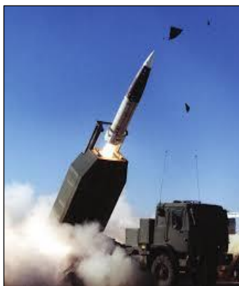
Figure 4. ATACMS Launching