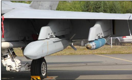
Figure 3. JASSM Attached to an F/A-18D Hornet