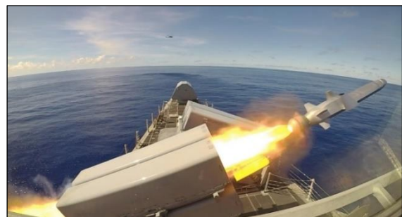
Figure 5. NSM at Launch