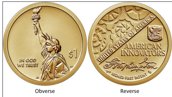
Figure 4. 2018 American Innovation $1 Coin