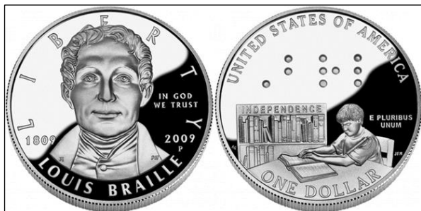
Figure 3. Louis Braille Bicentennial Silver Dollar