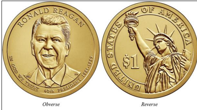
Figure 2. Ronald Reagan Presidential $1 Coin